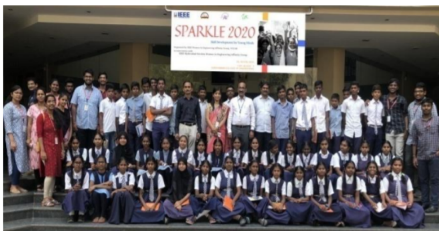
Group Photo with Participants

IEEE Hyderabad Section Women in Engineering AG in collaboration with IEEE VCE SB organized a two- day program for government high school children where in the students were taught skills to improve their computer literacy and communication. The students were briefed about the importance of computer in day to day activities and learnt few essential thing like how to create a power point presentation, uses of Microsoft excel. All the students had hands-on experience and were very much satisfied with the program. The program also focused on creating awareness on Cyber Crime and Security for the young children. The volunteers explained the usage possibilities of personal data in an inappropriate manner. Over 80 participants were benefitted with the session.