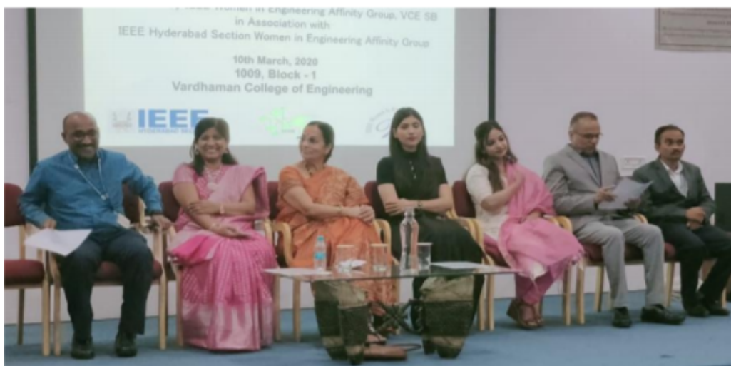
Photograph of the invited guests on the dias