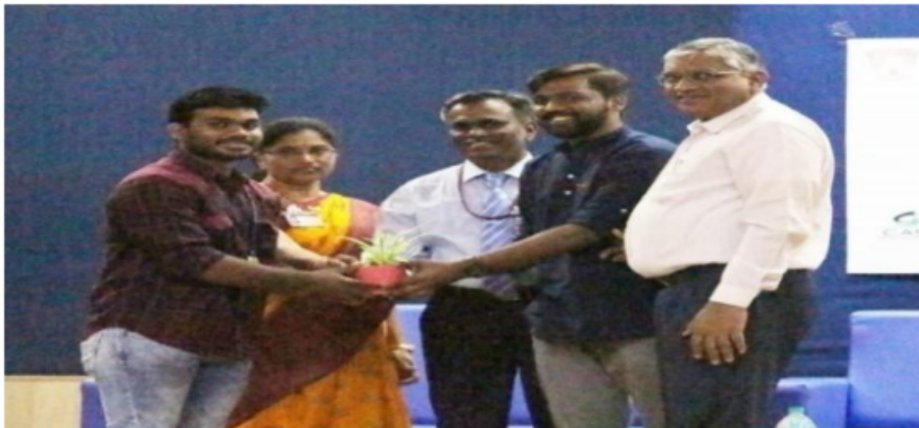
Presenting the token of gratitude to speaker