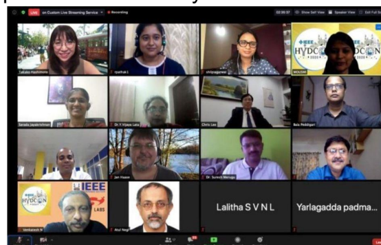
WiE session during SIT