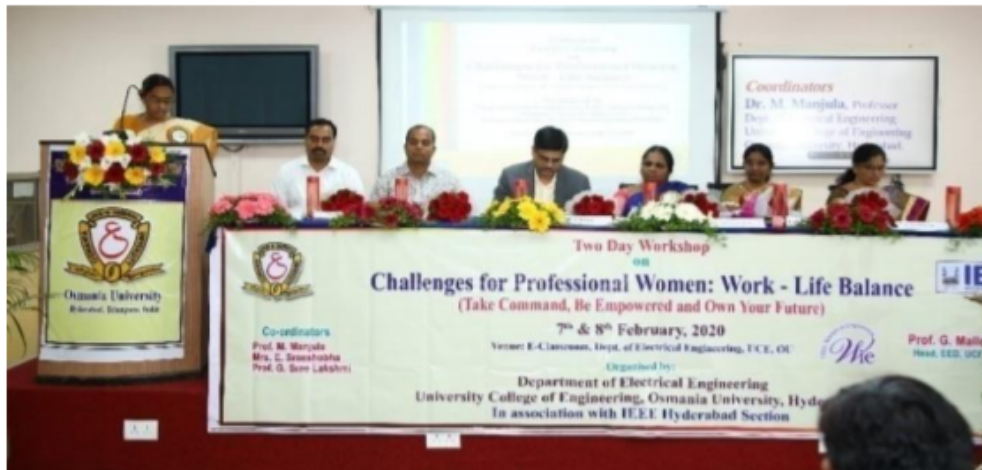
Inauguration Photo of Workshop