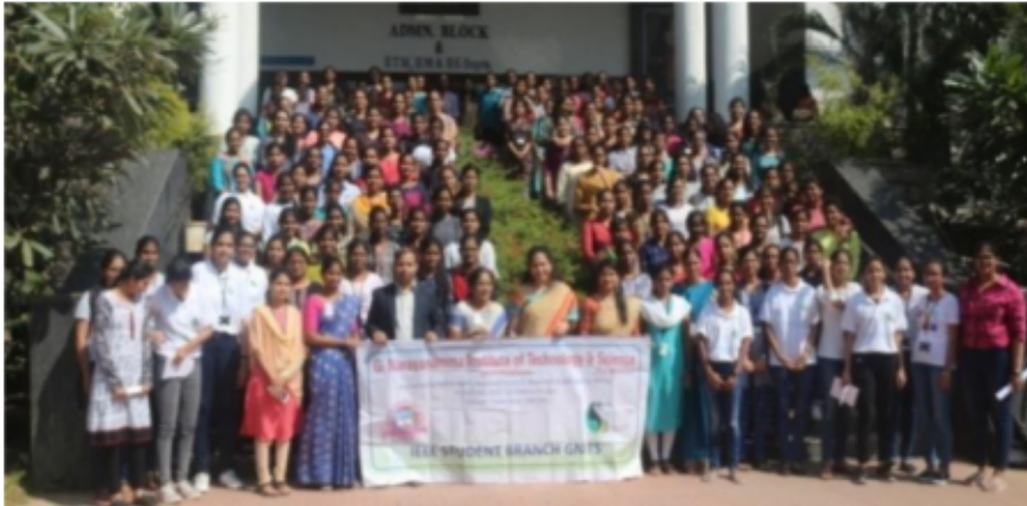
Group photo with participants