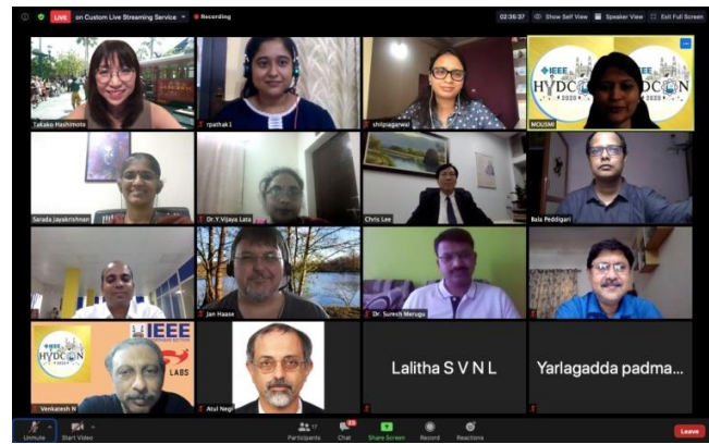
WiE session during SIT