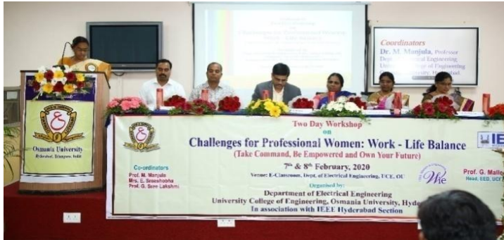
Inauguration Photo of Workshop