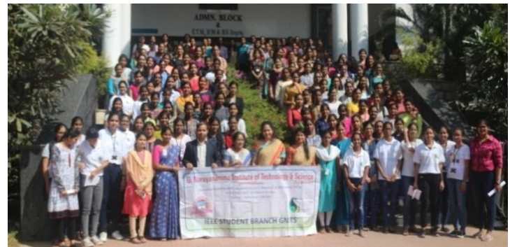
Group photo with participants