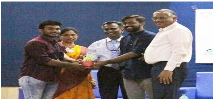
Presenting the token of gratitude to speaker