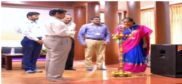
Lamp lightening by the dignitaries