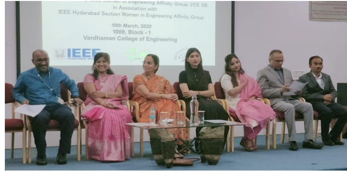
Photograph of the invited guests on the dias