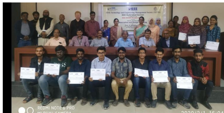
Group Photo with Participants