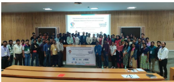
Group Photo with Participants

Total 15 technical talks and two poster presentations were planned like Electromagnetic Pedagogy, Insights into Maxwell's Equation, Teaching and Learning Electromagnetics, Don't kill your Research by Indifferent Writing HPM applications for Directed Energy Weapon, Structurally Integrated Antennas for Airborne Application of EM waves in plasma. At the end, a Panel discussion was organized on Collaborative opportunities for Academia followed by vote of thanks.