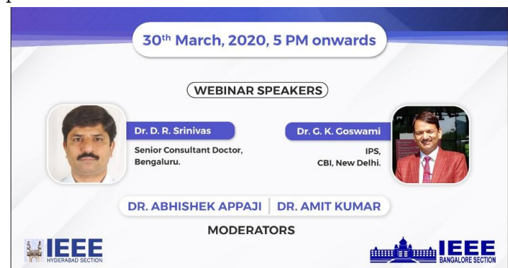
Poster of IEEE India CovidMove Hackathon

innovative solutions of unmet needs and Problems due to the sudden outbreak of COVID-19 Pandemic. Students all over India could participate and work as a team towards a common goal of building a successful project in order to overcome the current situation by working upon the solutions to different problems.