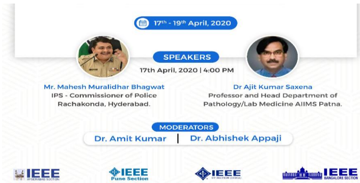
Poster of IEEE India CovidMove Hackathon 2

solutions for the problems caused due to the sudden outbreak of Covid-19 pandemic. Unlike the first edition, this Hackathon focused at challenging students with various problems which need solutions around the globe. Students all over India could participate and work as a team towards a common goal of building a successful project in order to overcome the current situation by working upon the solutions to different problems.