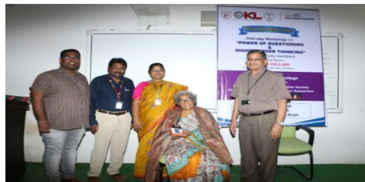
Felicitation of Speaker