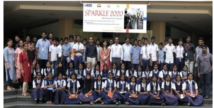
Group Photo with Participants

computer in day to day activities and learnt few essential thing like how to create a power point presentation, uses of Microsoft excel. All the students had hands-on experience and were very much satisfied with the program. The program also focused on creating awareness on Cyber Crime and Security for the young children. The volunteers explained the usage possibilities of personal data in an inappropriate manner. Over 80 participants were benefitted with the session.