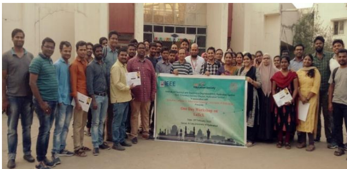
Group photo with Participants