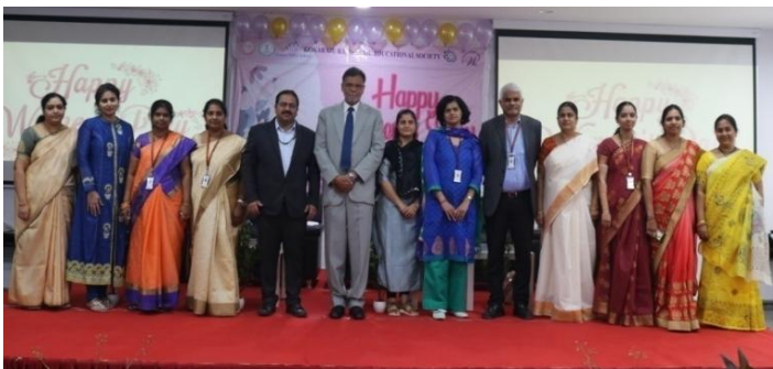
Group Photo of Speakers and Organizers