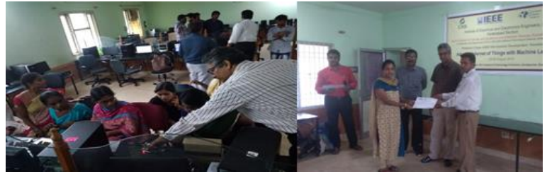
On-going session & certificate distribution