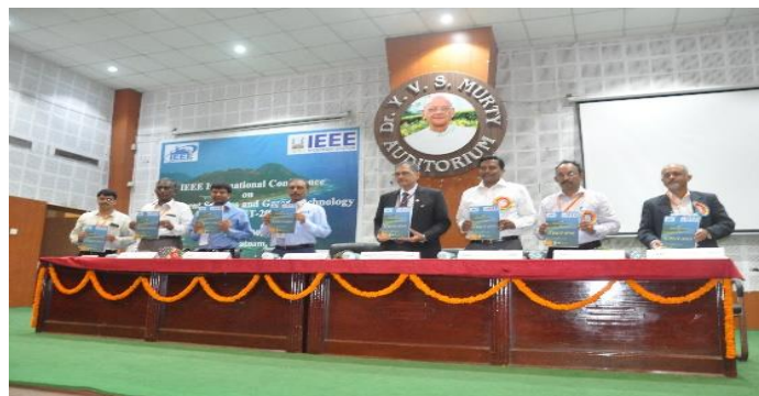
Conference proceeding was released by dignitaries