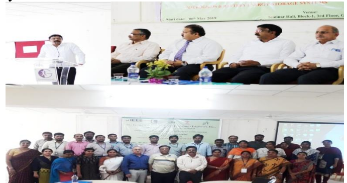
Group photo with participants

IEEE PES/IAS/PELS Chapter, Hyderabad section organised a Professional Development Program in association with Geethanjali College of Engineering and Technology (GCET) Hyderabad on "Micro-Grids & Battery Energy Storage Systems" from 6-11 May 2019 at GCET, Hyderabad. This program was attended by Industry Professionals, Young Professionals / Faculty in Academic Institutions and Research Scholars. Total eight IEEE and 32 non-IEEE members attended the same. In this event, introduction to the micro grid scenario integrated with Battery Energy Storage System (BESS), Power Electronic Convertors, protection, instrumentation and hand-on demo session on interconnection of micro grids were explained. Lastly, a field visit was arranged for the participants to the Factory of M/s NED Energy Limited, in Medchal, Hyderabad.