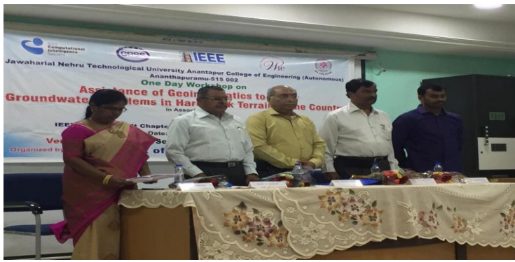
Dignitaries on dais