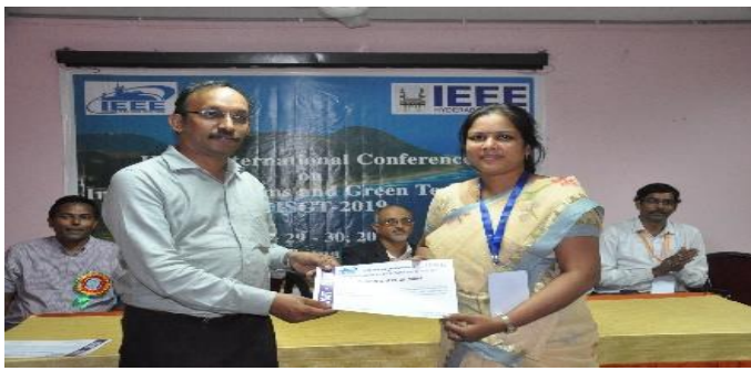
Participant receiving certificate during Valendictory function