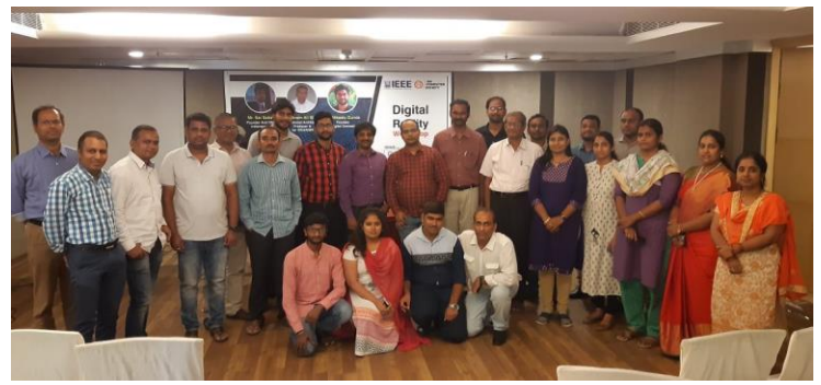
Group photo with participants @ Hotel Plaza