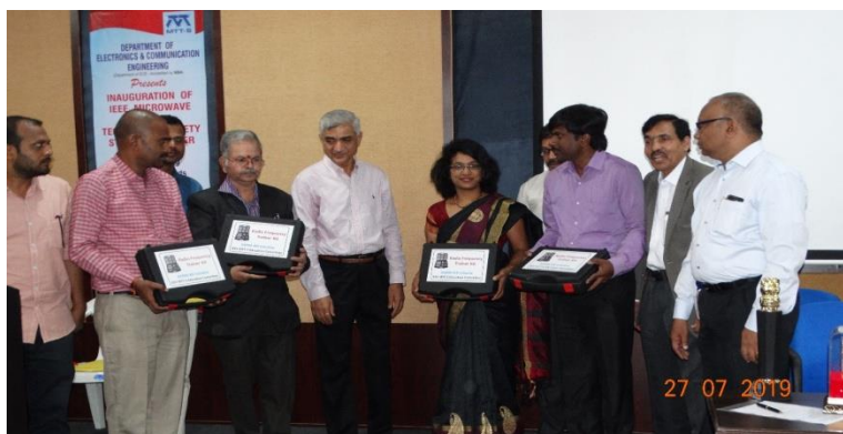
Distribution of Antenna kits to various colleges