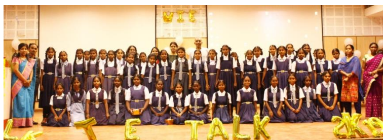
School girl students from ZPHS Narkhuda, Shamshabad