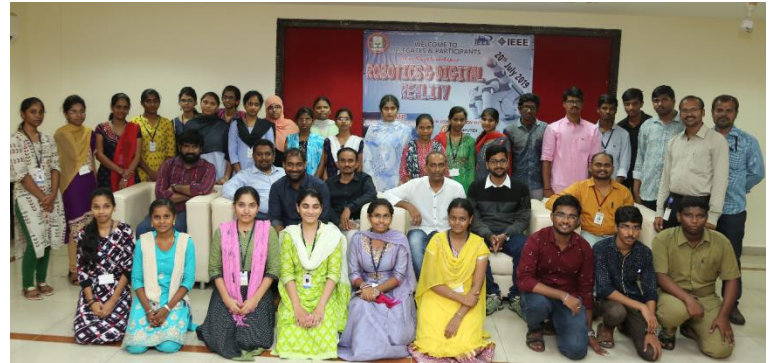
Group photo with participants @ PSCMR college, Vijayawada

This event was reconducted in association with IEEE Vizag Bay Section in form of a half-day Workshop on Robotics & Digital Reality on 20 July, 2019 in association with PSCMR College at Vijayawada. Over 50 delegates participated in this program.