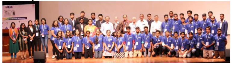
Students volunteers with Hyderabad section executive committee members