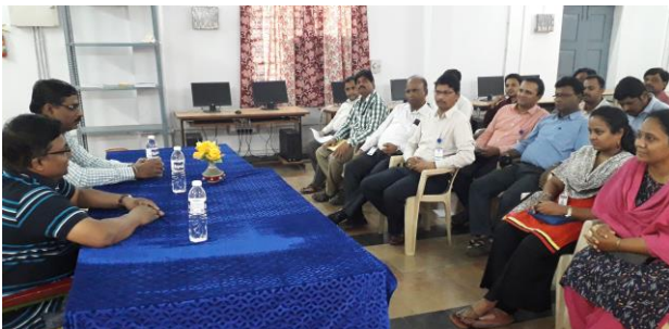
Interaction of speaker with faculties