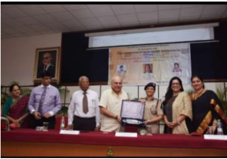
Women's Day – Balance for Better at MJCET