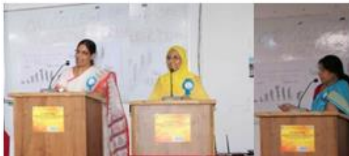
Speakers of the event