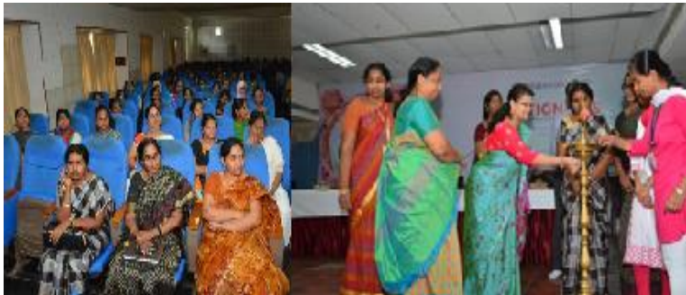
Dignitaries lighting the lamp

Women in Engineering Affinity Group (WIE-AG), IEEE Hyderabad Section organized a two day National Level Event “Women’s Leadership Symposium – A Multidimensional Awareness Program on Legal, Cultural and Financial Aspects”, during 25th - 26th February, 2019 in Sravanthi Seminar Hall of ECE Dept., by WEDC, WIE, IEEE Student Branch of VFSTR (Deemed to be University) in collaboration with Women In Engineering (WIE), IEEE Hyderabad Section, IEEE Guntur Subsection at Vignan’s University, Guntur. The Symposium had a galore of events like plenary talks, Panel Discussions, Poster Presentations and Workshop by eminent experts on Financial Management which provided an exciting and a rich learning experience for all aspirational and career conscious women who wish to do responsible roles and grow professionally in their respective organizations. More than 180 womens attended the event.