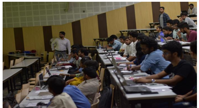
Hands-on Session during the event