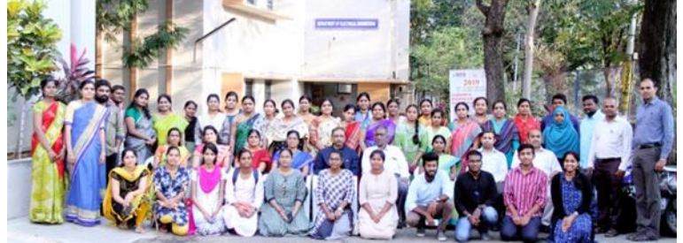
Group photo with participants and organisers