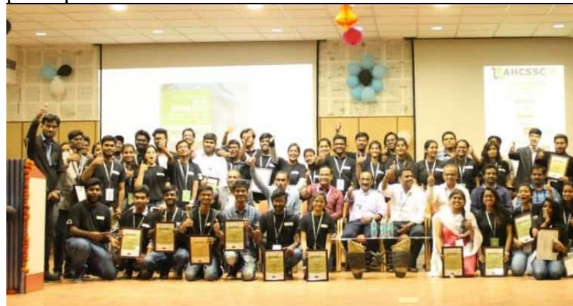
Group Photo of Participants with dignitaries