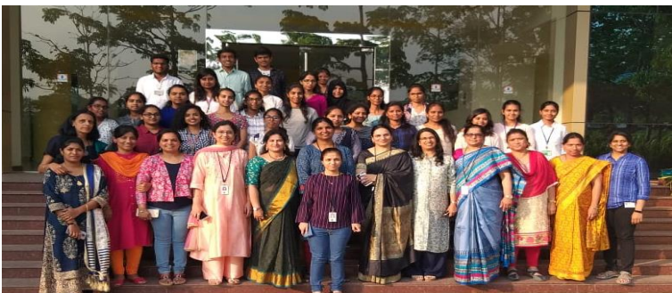
Group Photo at Infosys "Women Conclave"

Women in Engineering Affinity Group, IEEE Hyderabad Section in collaboration with Infosys organized a one day event "Women Conclave - a meet of Corporate and Academia Women" at STP, ECC block, Infosys, Gachibowli, Hyderabad. Total 80 participants were benefitted from this event. Under the aegis of International Women's Day Celebration to progress the women in technology. This event has given an opportunity to collaborate, share, learn and inspire through interactions with corporate women with academia women and experts across industry. The event has taken on 22 March at Infosys, Gachibowli branch, Hyderabad from 9.30 AM to 4.30 PM.