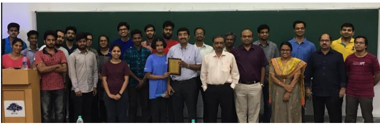
Group photo with speakers and participants