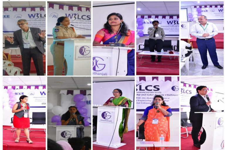
Speakers at Glance for WILCS workshop @ GCET

Women in Engineering Affinity Group (WIE-AG), IEEE Hyderabad Section conducted a two day workshop on "Professional Leadership & Cyber Security Challenges" at Geethanjali College of Engineering and Technology, Hyderabad. The Theme of the event is "Aware & Explore to Build a Strong New Woman of yourself". To create yourself "A New Woman with Confidence" to encourage yourself and to excel beyond any obstacles facing in your life, on 1st & 2nd February 2019, in order to get awareness of crimes- causes and finding a solution to develop a technical career for safe India through professional leadership to "Explore your World & Explore your Life," from 9 AM to 5 PM at CSE Seminar Hall, Geethanjali College of Engineering and Technology, Cheeryal, Keesara (M), Medchal (Dist.)-501301, Hyderabad.