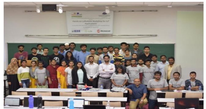
Group photo of participants with organisers