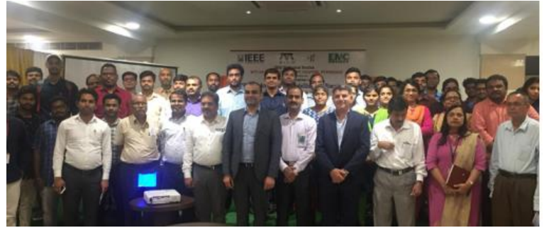
Group photo with speakers and participants