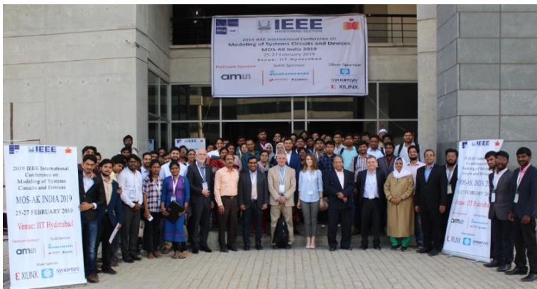
MOS-AK/India conference participants at IIT Hyderabad