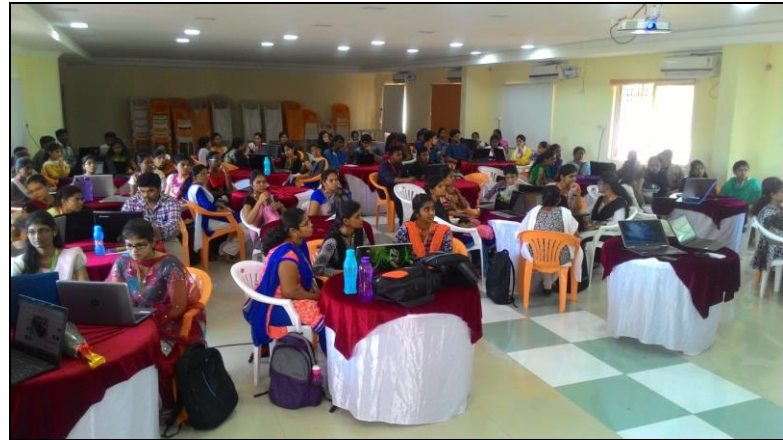
A section of the audience during the Hadoop workshop

Hadoop was the key resource person. The various topics covered in this workshop include Introduction to Big Data and Hadoop, Hadoop Distributed File System. The workshop was a huge success with 74 participants of which 11 were IEEE members. The participants were happy with the organization of the content and planning of the series of workshops focusing on one particular technology. Most of the participants were happy with the organization of the content and planning of the series of workshops focusing on one particular technology. However, the participants could not complete the necessary installations well in advance and due to this proposed content could not be covered.