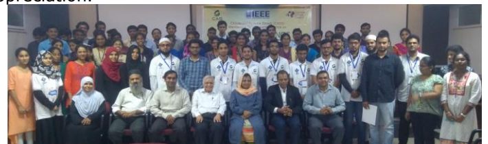
Participants of IoT workshop with faculty and organisers