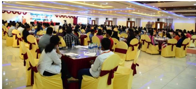
Audience at a glance at Zonal Congress at Warangal

IEEE WIE CONGRESS Warangal Zone has been organized by “IEEE WIE Hyderabad Section” in “Warangal” - the historic city of Telangana which was sponsored by IEEE WIE Region 10 and IEEE Hyderabad Section. More than 250 participants from over thirteen different engineering colleges of IEEE Hyderabad section attended and made the event successful.