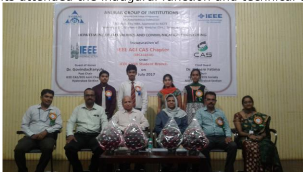
IEEE CAS/EDS Execom with officials of AGI

gave a technical talk on Analog VLSI Design. He educated the students on the various career opportunities in the VLSI Design industry and encouraged them to take up research projects in this area and publish papers in IEEE Conferences. The talk was very well received by the audience, about 250 students attended the inaugural function and technical talk.