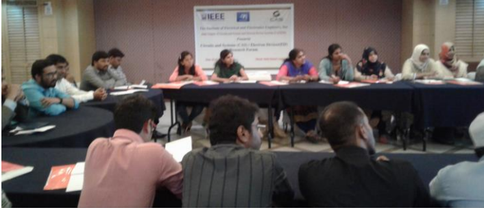
A section of the audience at research forum