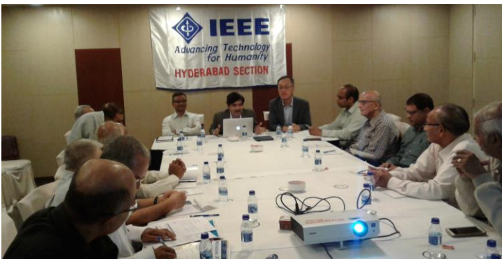
Section ExeCom in meeting with R10 Director