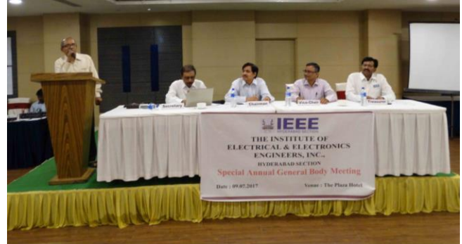
Office Bearers of IEEE Hyderabad Section during SAGM 2017