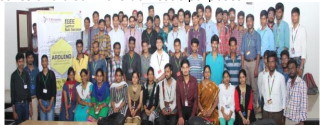
Participants of the Arduino Workshop at KLU