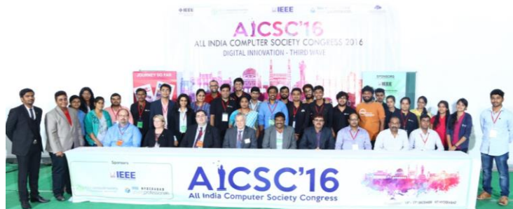
Participants of AICSC 2016