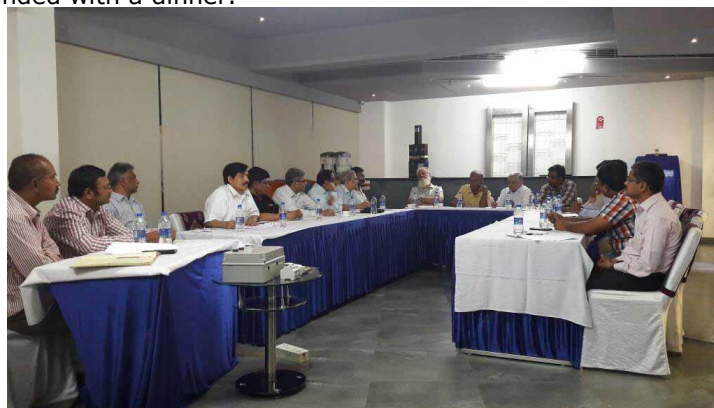
A glimpse of strategic planning meeting of PES/IAS/PELS chapter

The members presented their concerns on mobilizing good mix of volunteers from senior professionals and enthusiastic youngsters, Value edition by Distinguished Lectures, Tutorials and Skill development workshop, attracting discerning participants for the events. The guests from the Industry responded and suggested remedial measures and an action plan was made to deal with the above issues. The event ended with a dinner.