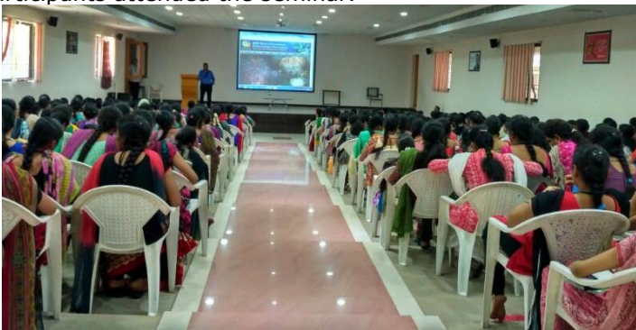
A glimpse of the participants at RWEW