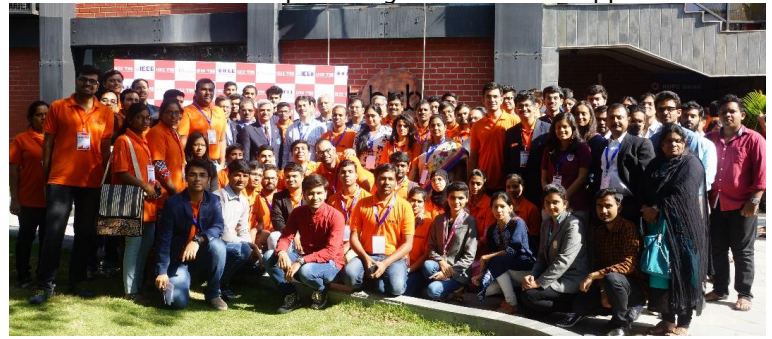
Participants at TES 2016 at T Hub, IIIT Hyderabad campus

with their active presence. We would also like to thank all the fantastic volunteers and the IEEE fraternity for trusting us with this initiative and providing us with their support.