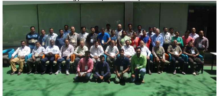
Complete Executive committee of IEEE Hyderabad Section