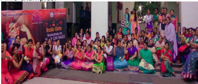
Participants of Ruby on Rails workshop

The IEEE Women in Engineering Affinity Group in collaboration with IEEE Guntur subsection organised a Workshop titled "Ruby On Rails" on 8 March 2017 at Koneru Lakshmaiah University (KLU). The workshop focused on the basics of programming in Ruby i.e. data types, arithmetic operations, arrays, hashes, control structures and methods. Workshop is aimed at bridging the gap between theoretical sessions and hands-on sessions with practice. The morning session required the participants to accomplish a task of developing a BMI calculator. Rail is a server-side programming framework written in Ruby. The basic understanding of MVC framework and its functions were dealt with live examples.