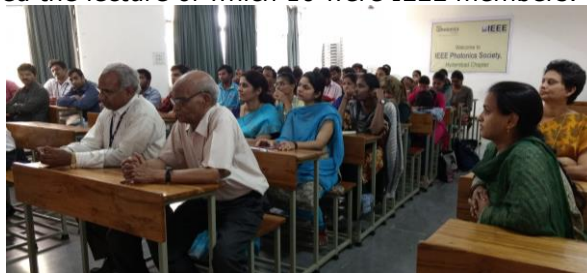
Section of Audience during the Technical Talk

Scientist "H" (Retd) "Visiting Professor, IIST, Trivandrum Director (Retd), Optics Group, LABORATORY FOR ELECTRO OPTICAL SENSORS (LEOS), ISRO, BANGALORE" on 16 March 2017 at Vasavi Engineering College. About 50 persons attended the lecture of which 10 were IEEE members.