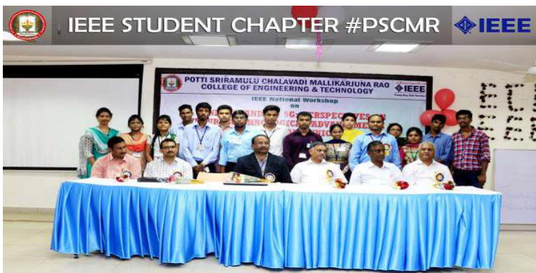
Executive Committee Members and guests at IEEE Student Chapter Inaugural