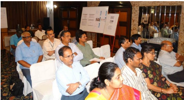
A section of the participants at SAGM 2015