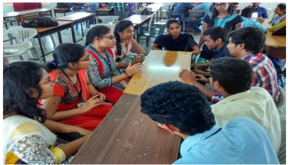
Students of GRIET, SB participating in the Interviews

This was conducted on 23 rd of July 2015 from 2.00PM to 4.00PM. The selection process comprised of 3 rounds, with each round testing a different skill in the candidate. After a thorough scrutiny, 12 candidates, from the batch of 78 candidates were selected into the Junior ExeCom for the term of 2015.