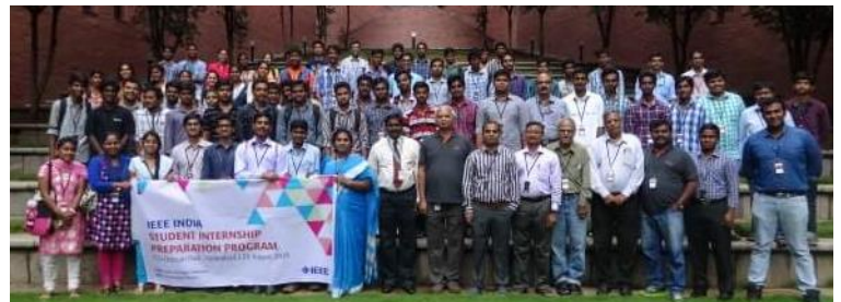
Participants of IEEE India Student Internship program - Hyderabad